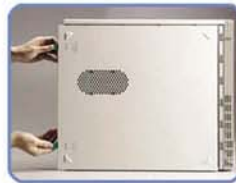
❖ Easy Assembly & maintenance