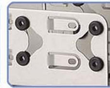
❖ HDD shockproof kits