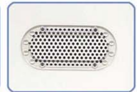
❖ Optional Acrylic side vent cover