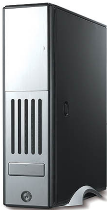
ECE1341BAL BTX Slim (Aluminum front panel)