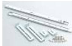
Optional Slide rail for easy maintenance ( R3500 ).