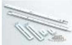
Optional Slide rail for easy maintenance ( R3500 ).