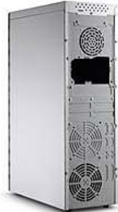
MS1201 Inside & Rear View