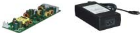
open frame PCB + adapter